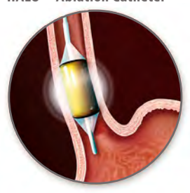
HALO<sup>360</sup> Ablation Catheter